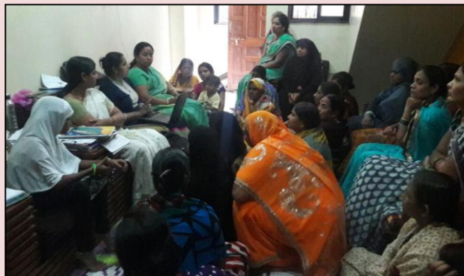
Awareness talks given by our Medical Social Workers at various venues all over Pune