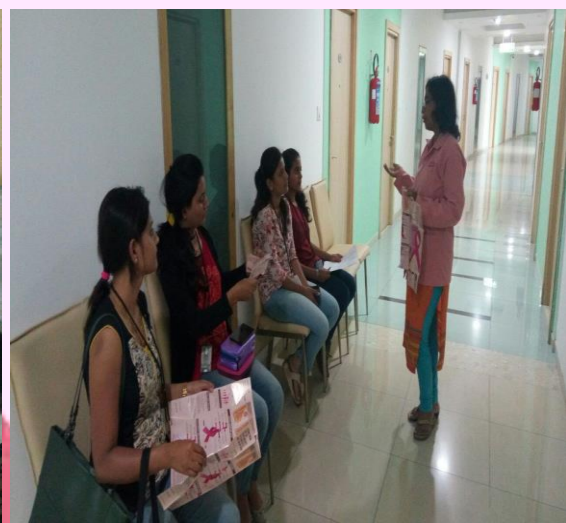
CBE Camp at Infosys