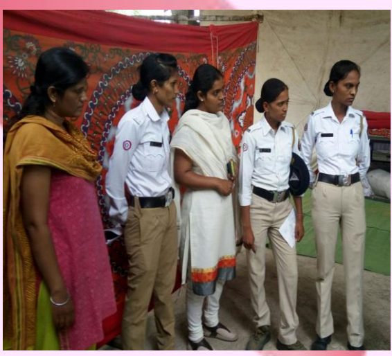
CBE Camp for Gramin Police Force